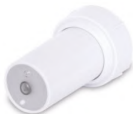
pH Electrode: for measuring semisolids