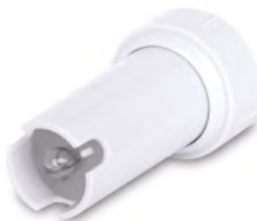
pH Electrode: for measuring liquids